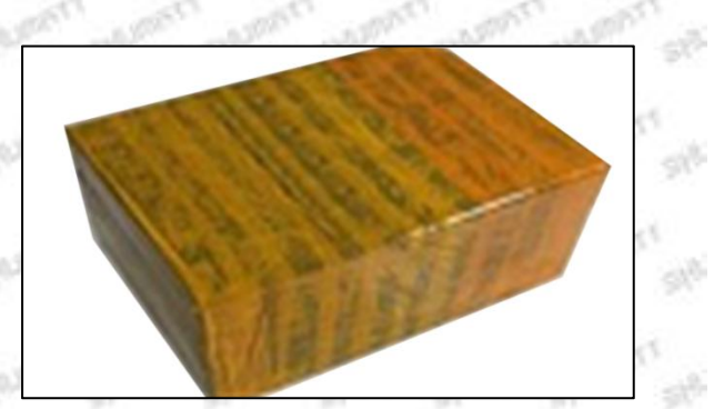
Pic No.3 International express packaging: Wrapped with yellow tape after wrapping black protective film

Pic No.2 Domestic express packaging: Wrapped by Transparent tape